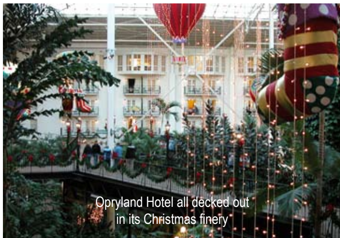
Opryland Hotel all decked out in its Christmas finery