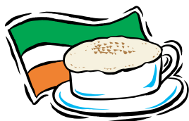
Table is set with everyday dishes...doesn't matter if they don't match...they're clean, What more do you want?

All the utensils go on the right side of the plate and the napkin goes on the left. Put a clean kitchen towel at Nonno & Papa's plate because they won't use napkins.